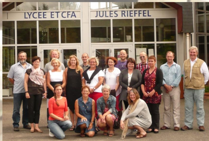
Partner meeting 3 in France