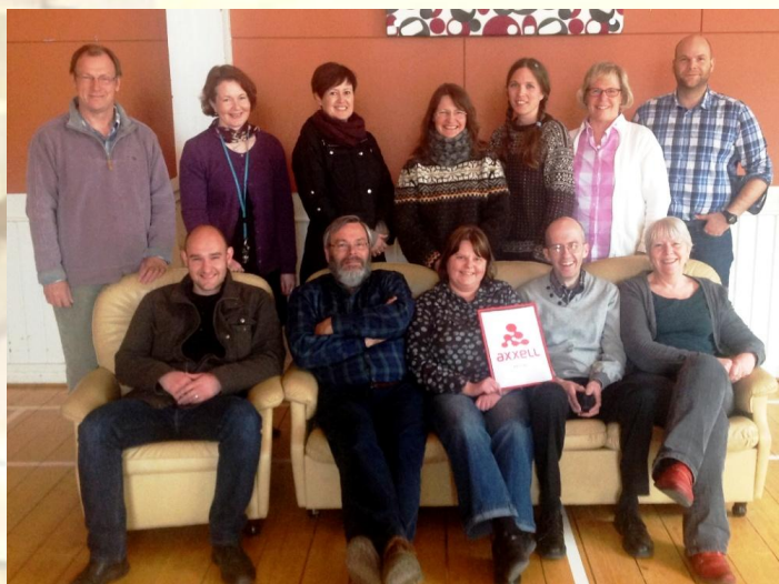
Partner Meeting 4 in Finland

Internet: http://workmentor.vma.is http://www.workmentor.eu